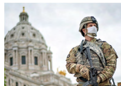
Minnesota National Guard soldier in front of Capitol

The mission and jurisdictional limitations of these entities are important context when reviewing their actions during this period. According to state law and precedent, these entities should not have played a central role during the events of May 26 to June 7, 2020.