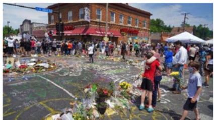
Memorial near Cup Foods

Vigils and peaceful protesting began immediately after the murder on May 25, at the scene (38 th Street and Chicago Avenue) and in other locations, and continued through June