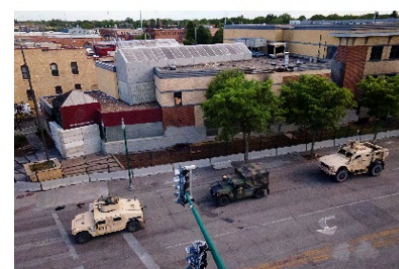
Minnesota National Guard and State Patrol vehicles near 3rd Precinct