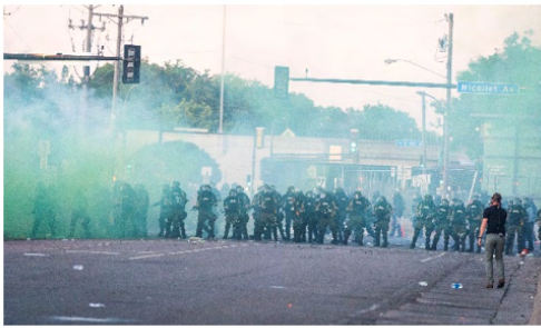
Police and tear gas near 5th Precinct Nicollet Ave.

That night, the State Patrol carried out what they later called a “shock and awe” response, using significant crowd dispersal methods to control attempted looting and violence toward officers. This occurred along Nicollet Avenue in Minneapolis near the Fifth Precinct on a crowd of 2,500-3,000 people, according to state documentation. Within an hour, a large portion of the crowd had dispersed.